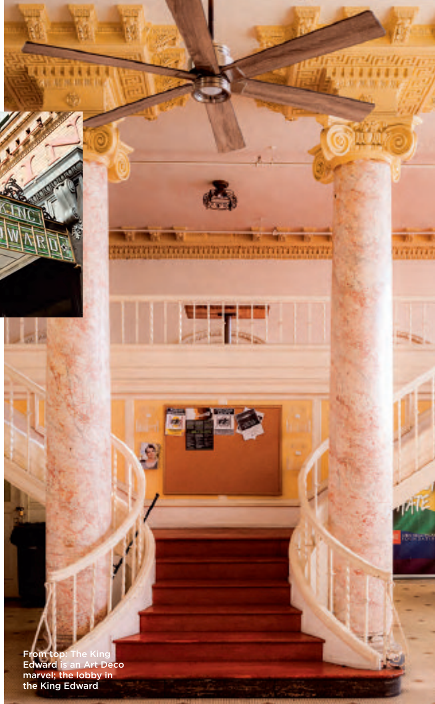
From top: The King Edward is an Art Deco marvel; the lobby in the King Edward