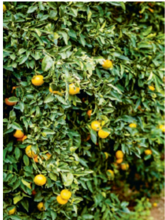
SHORE THING From above: The Arab fishing village of Jisr az-Zarqa; the area is dotted with orange trees

It's here that I find myself taking a few, deep, soothing breaths as I roll into Binyamina Station. The Northern Coastal Plain, that I've arrived hoping to explore, extends for some 70km along the far eastern edge of the Mediterranean between the modern tourist resorts of Netanya and the ancient port of Haifa. The region is just a 40-minute train ride from Tel Aviv but feels light years away. Here, Israel's contradictions aren't so much absent as they are ironed out: Arabs and Jews live side by side, united by a shared